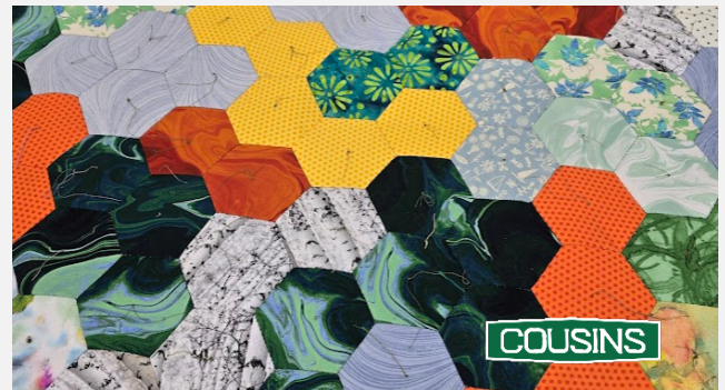
A swatch of the Stitching Stories quilt coming together.