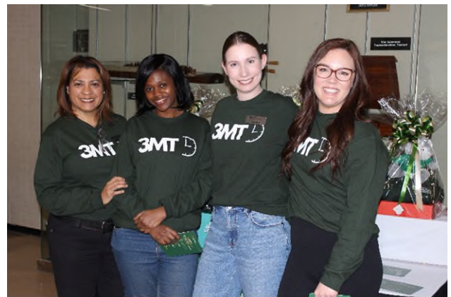
CGPS staff were on deck to volunteer and support the competitors at the 3MT Finals (Apr 2025).

communication skills felt truly validated, and that experience opened the door to so many meaningful connections and opportunities. It also deepened my love for my project and confirmed that grad school was the right path for me. So thank you again for the incredible effort you put into making the 3MT happen—my grad school journey would look very different without it.