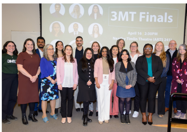
3MT 2026 finalists and judges