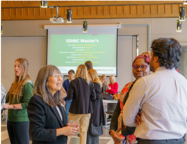
Students, supervisors, and other members of the USask community attend the annual Celebrating U event