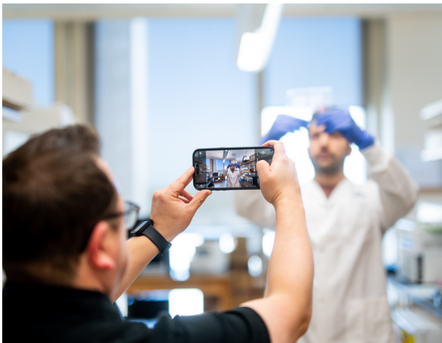
Graduate student researchers captured at the Sask Cancer Agency as part of the photoshoot for graduate recruitment efforts