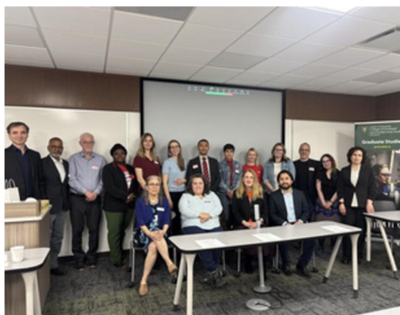
InterD students, supervisors and advisors attending the InterD Annual Symposium