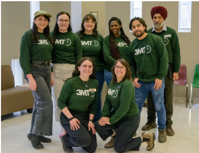
CGPS staff volunteer at the 2026 USask 3MT Finals