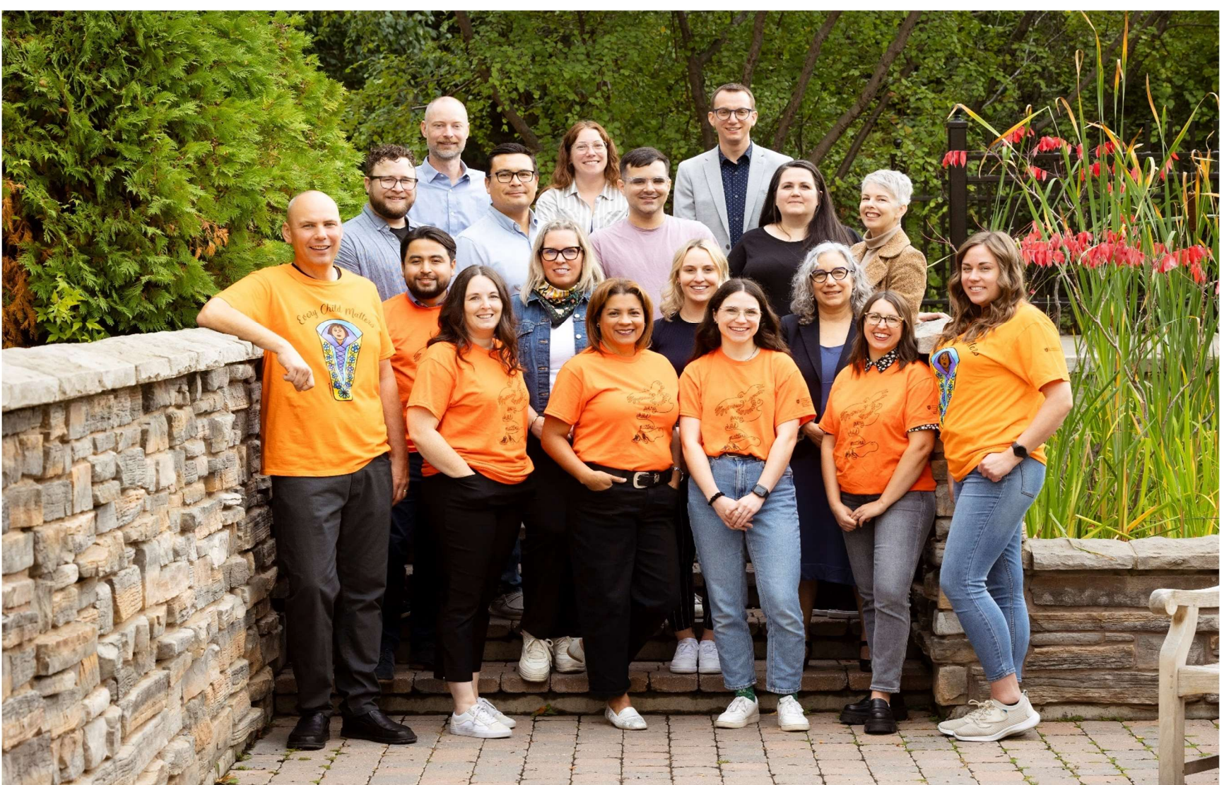
Image 1 CGPS Staff September 2023

Our goal remains fostering a more inclusive and equitable academic environment where all students and postdoctoral scholars thrive.